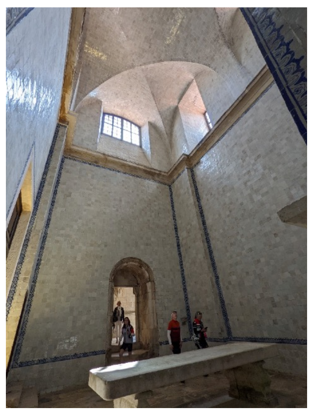
Kitchen at the Alcobaça Monastery