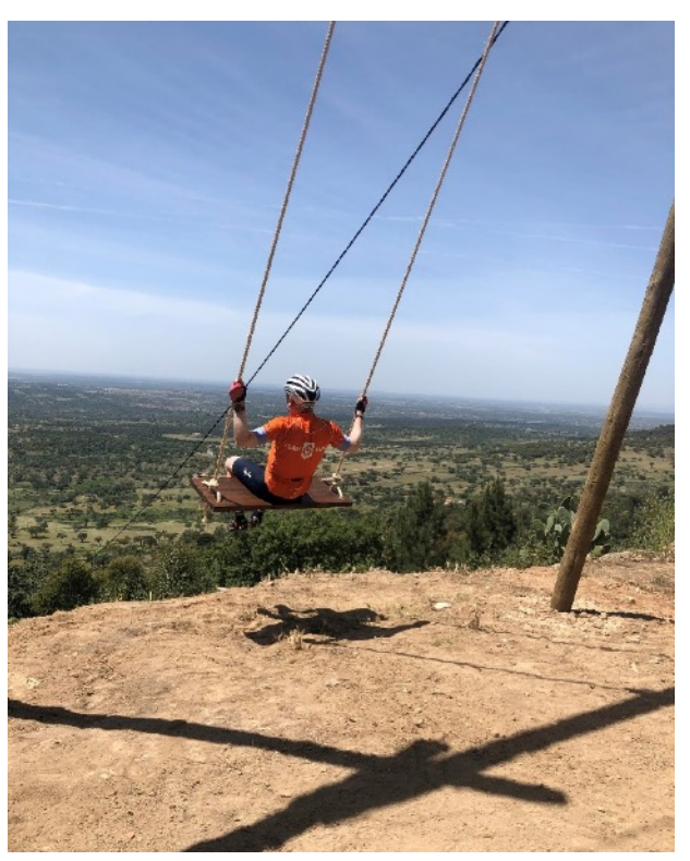
Swinging high over Portugal