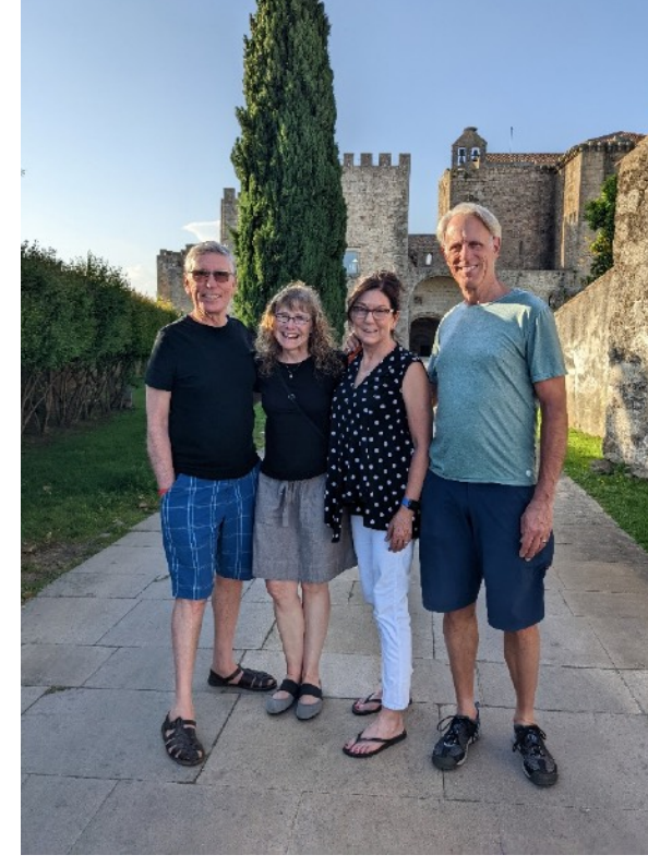
Lots of smiles after a good day of cycling