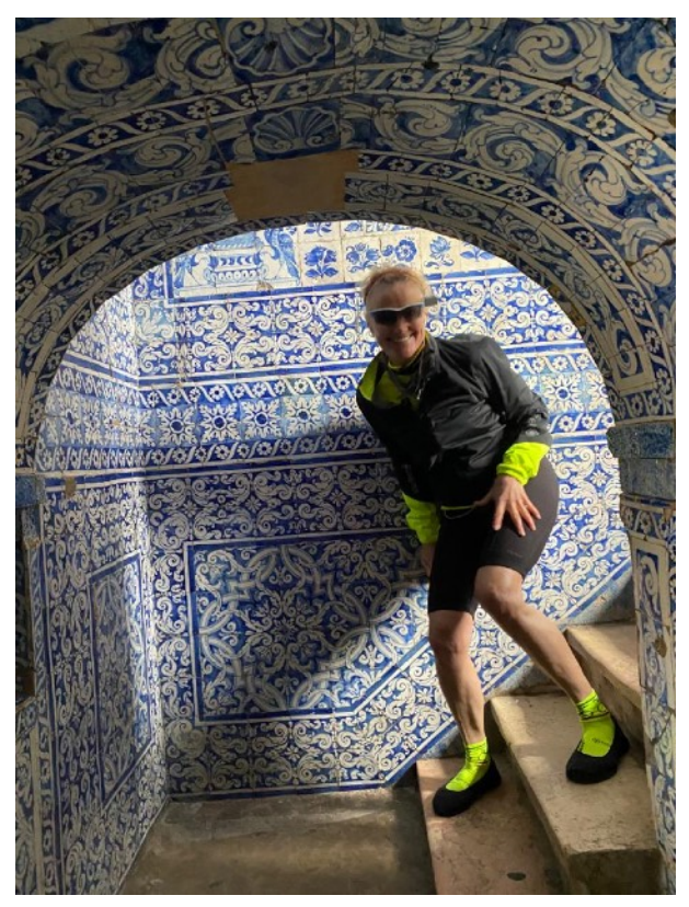
Surprise! Exploring a Little Temple at Nazaré