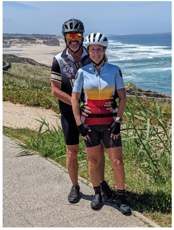
Along the Atlantic at Praia da Foz do Arelho