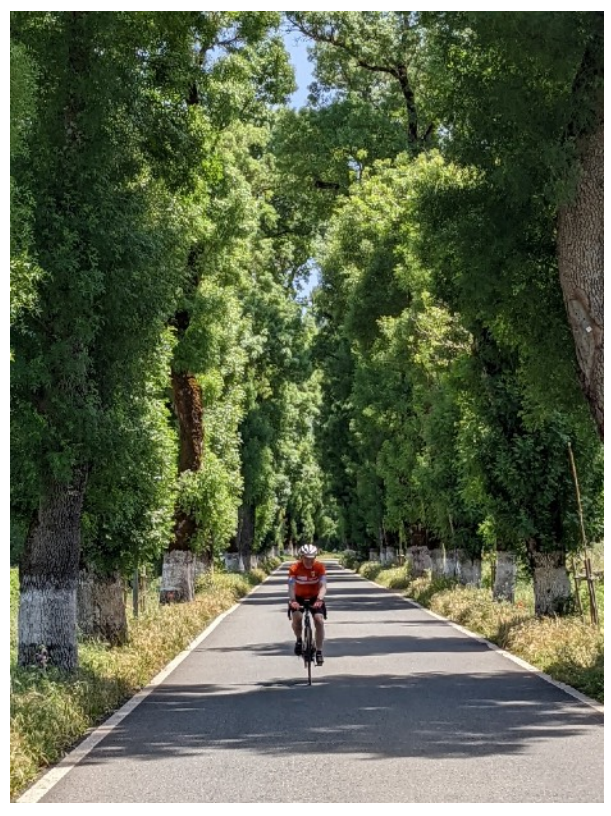
Smooth Pavement and Quiet Roads