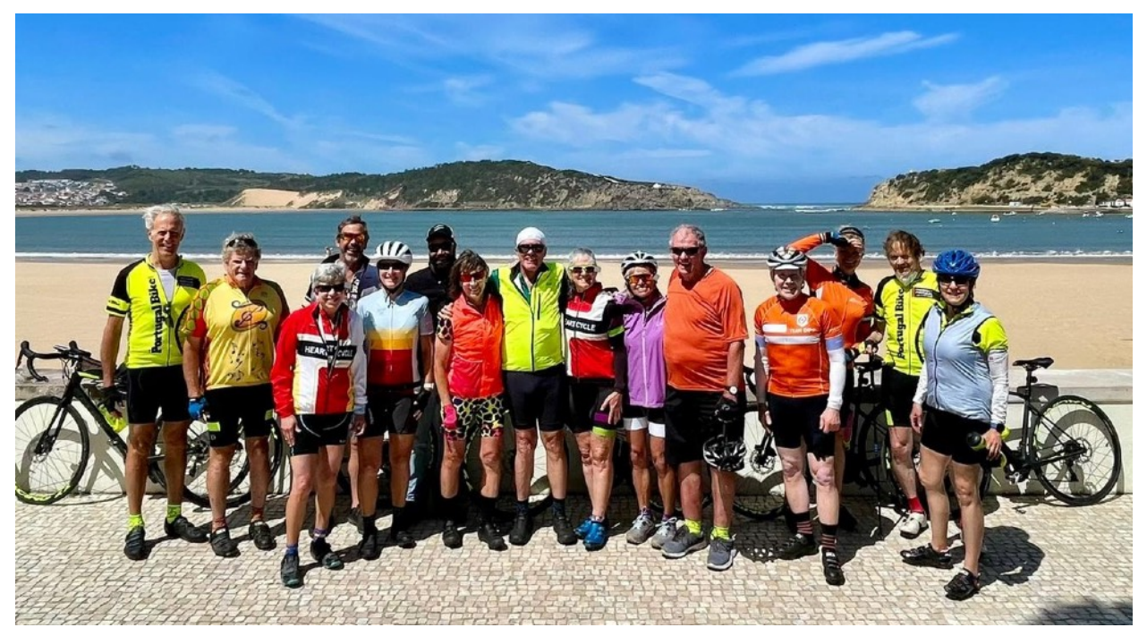
By the Bay of São Martinho

From May 8<sup>th</sup> through May 20<sup>th</sup> a group of 18 strong HeartCycle riders explored central Portugal on a 12 day tour covering 340 miles and climbing 21,000 feet in 8 days of wonderful cycling. Along the way we toured some of Portugal's most historic and scenic sites, in an excellent combination of sightseeing, luxurious accommodations, and great cycling on quiet roads.