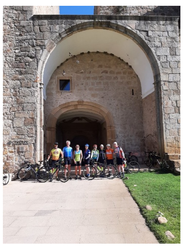
Our hotel – the Monastery of Santa Maria de Flor da Rosa (Pousada Mosteiro Crato)