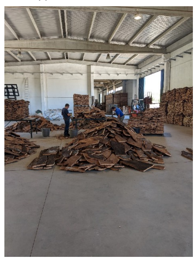
Touring a Cork Factory near Évora