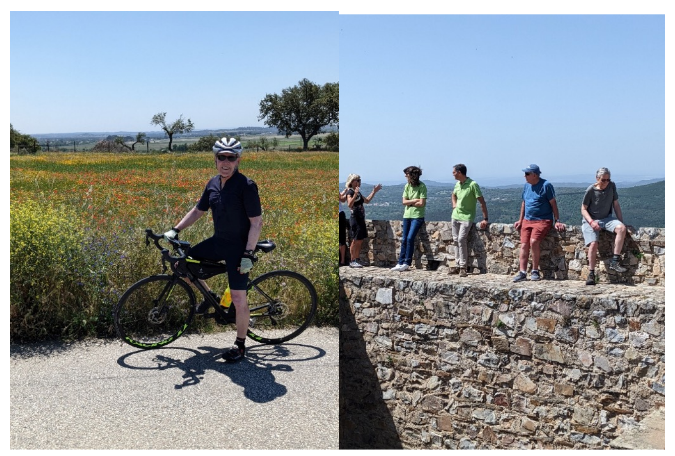
Fields of wildflowers along the way

met with us at the beginning and end, but also joined the group in the middle to conduct site tours, adding a personal touch. They were first class.