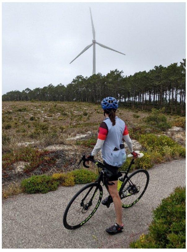
Lots of Wind Turbines