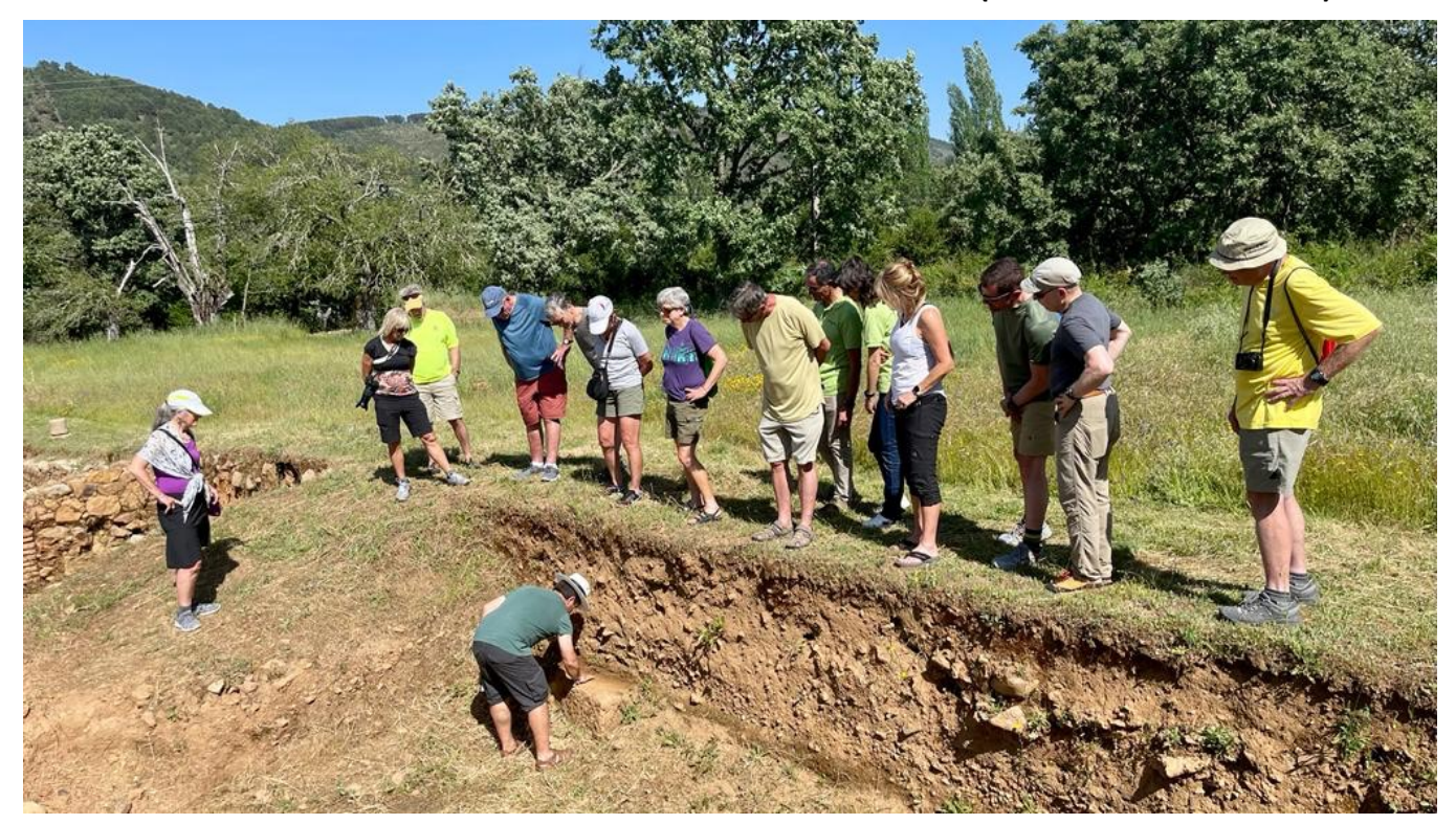
Excavation at the Roman Ruins of Ammaia