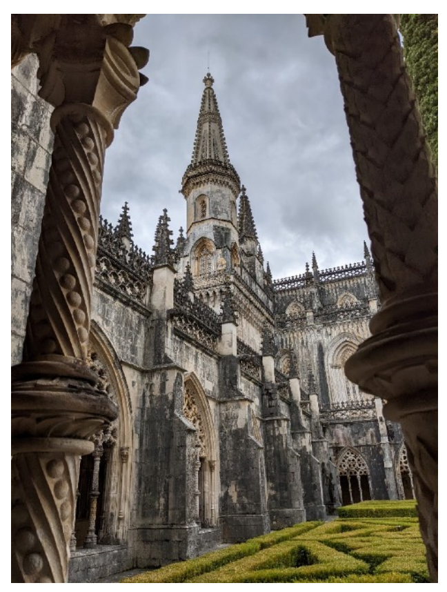
Monastery at Batalha