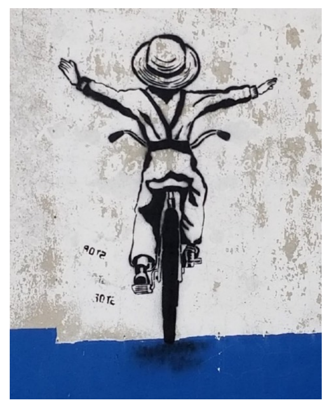
Wall Mural on the Back Road to Nazaré