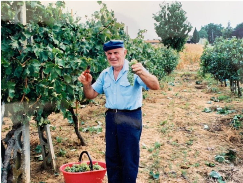
Local farmer harvesting the grapes

Our tour was in the fall during the grape harvest, so many days we biked behind the tiniest 3 wheeled pickups loaded with just picked grapes headed to the local wine enoteca. The smell of the grapes was so fresh. Seeing a small field filled with elderly locals clipping the grapes and putting the cuttings into large plastic cans in the back of the tiny pickup, I stopped for a photo and ended up with a bunch of grapes from a lady in a dress and rubber muck boots.