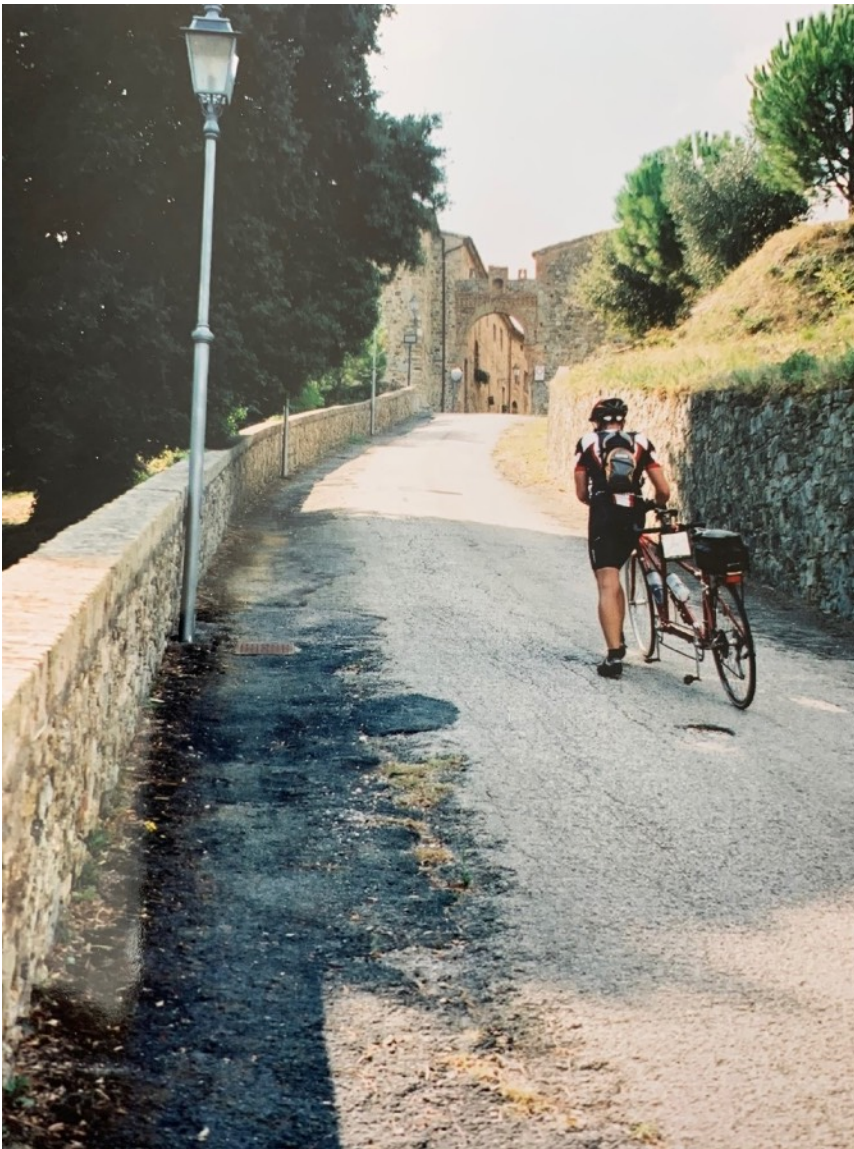
Steep grade into a hill town at the end of a long day

Waking the first morning in Val de Arno hearing Italian conversation drifting up from the street. Opening the shutters in our room to see our hotelier chatting with the woman in the second story of the house across the narrow street.