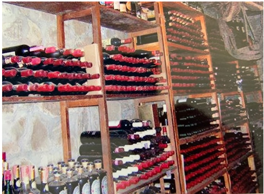
The wine cellar at Hotel Archimedes

What would a day of touring in a foreign country be if you did not take a wrong turn and end up in a village not on your paper map/cue sheet? (Long before GPS.) So we approached a group of cyclists on the edge of town and realized we got directions from Andy Hampsten. He put us on a windy, scenic road through a cork tree forrest near the western coast of Tuscany, it was stunning.