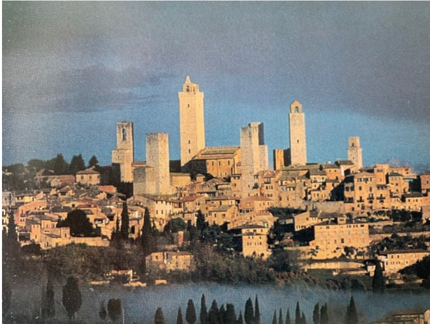
The fabled towers of San Gimignano

A tour of an olive oil factory where the press was 2 huge granite stones crushing the olives and pits into a paste to be pressed. Sadly, years later on a return visit the granite stone press had been retired for a modern stainless steel one.