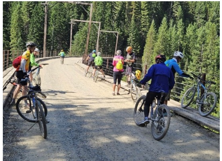
Day 6 brought us from Wallace along the Coeur d'Alene Bike Trail to Harrison in the southern end of Lake Coeur d'Alene. The trip featured a beautiful bridge over the Coeur D'Alene River.