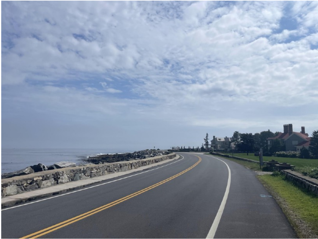
The insanely opulent Fox Hill Point, NH.