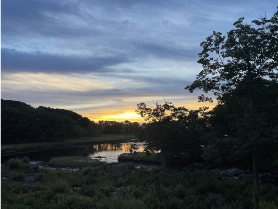
The sun rises on our final day, view from our hotel.