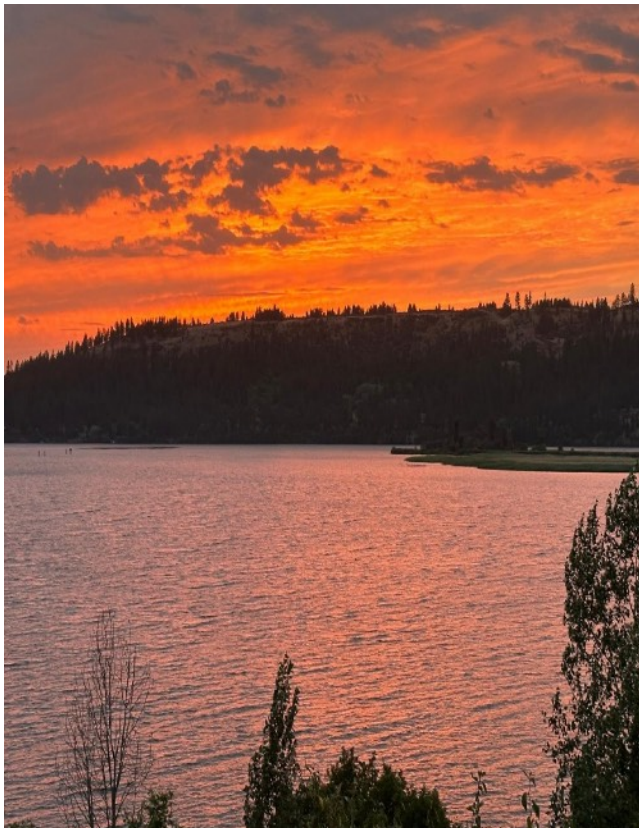
A bright sunset and a kayak trip greeted us in Harrison.