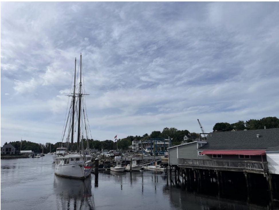
Kennebunkport, Maine. A classic New England village. Fun fact: The coastal position of Kennebunkport is home to a wildlife refuge where you are likely to spot cottontail rabbits and saltmarsh sparrows.