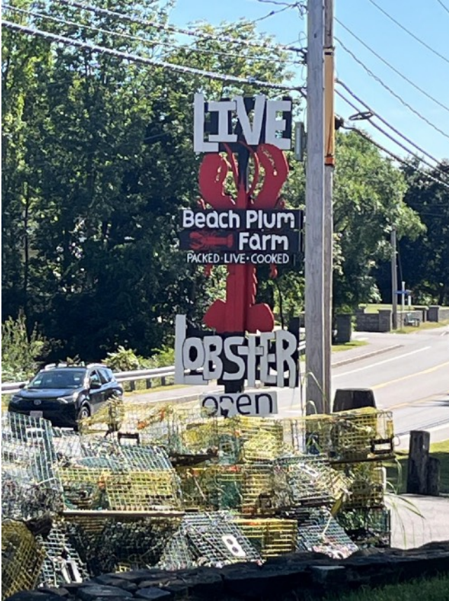
Our cycling crew pedaled by: the lobster shack- a lobster haven, the love shack-a romance retreat for some, and the wopie pie shack- for sweet delights.