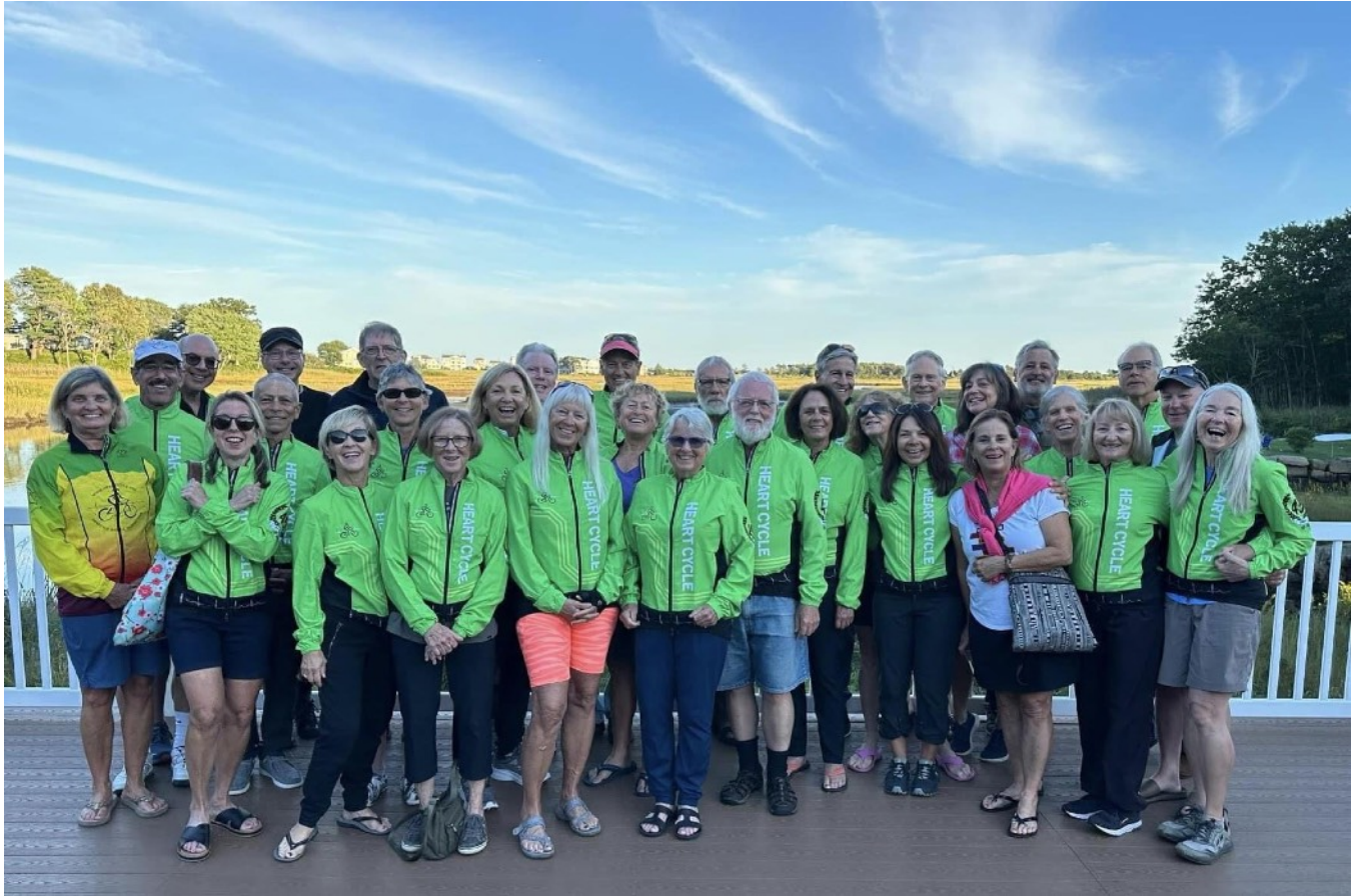
The NEST 2023 Team!