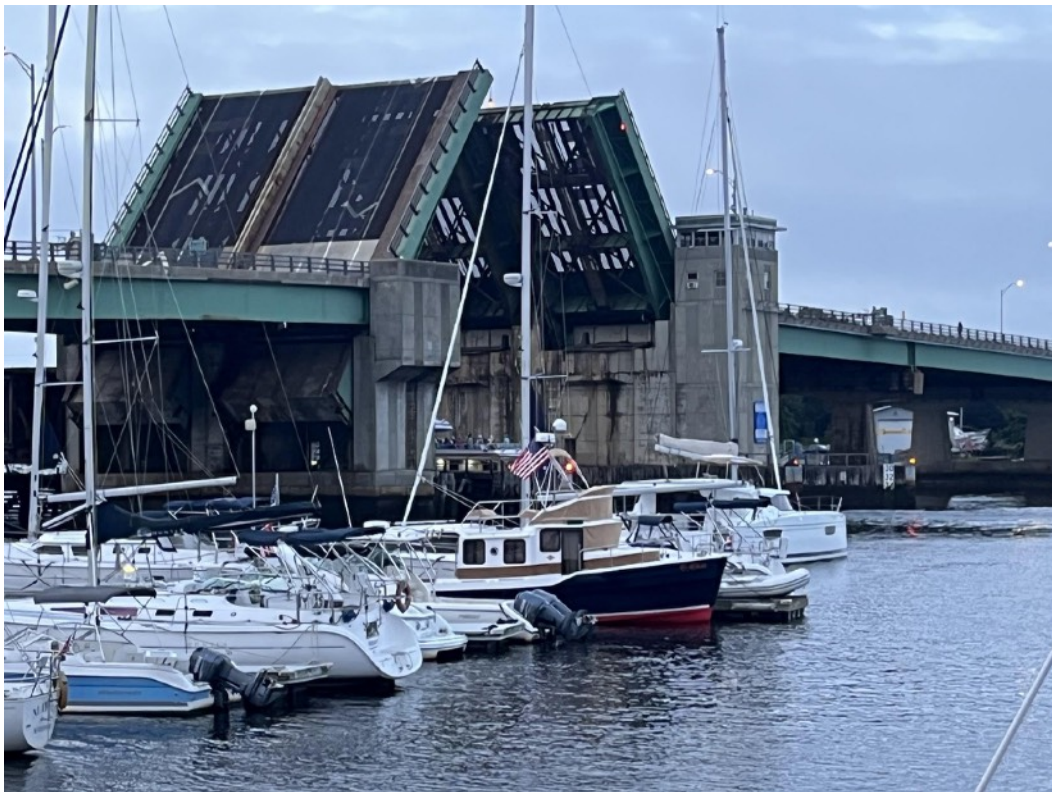
Sometimes ya just gotta wait.