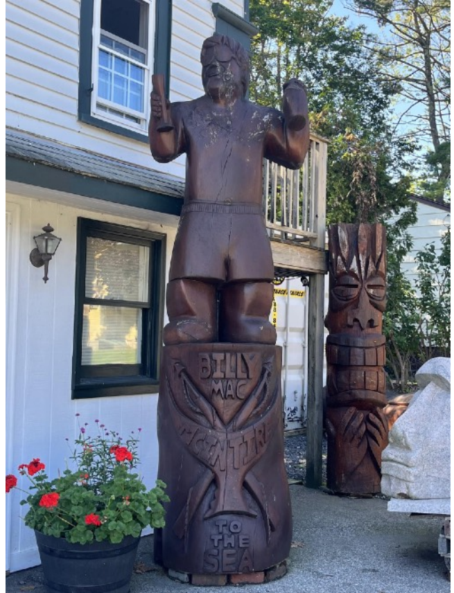
Ogunquit Day 2 brought us past the Nubble Lighthouse, another beauty. Fun fact: Citizens petitioned the US govt in 1874 to build this lighthouse to keep sea merchants safe on their journeys.