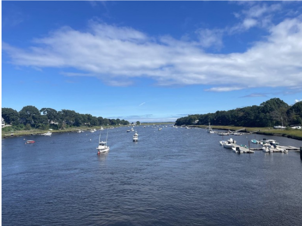
Just south of Newburyport a rainy day transformed. Fun fact: Newburyport Massachusetts is nestled on the shores where the Merrimack River meets the Atlantic.