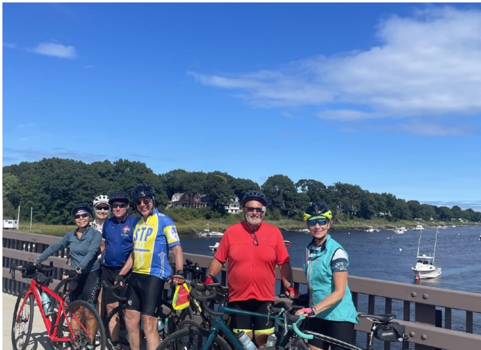
With the sun warming us, no real hurry to finish the day. Fun fact: Plum Island was named after the wild plums that grow here and the purple sand from eroded pyrope garnet.