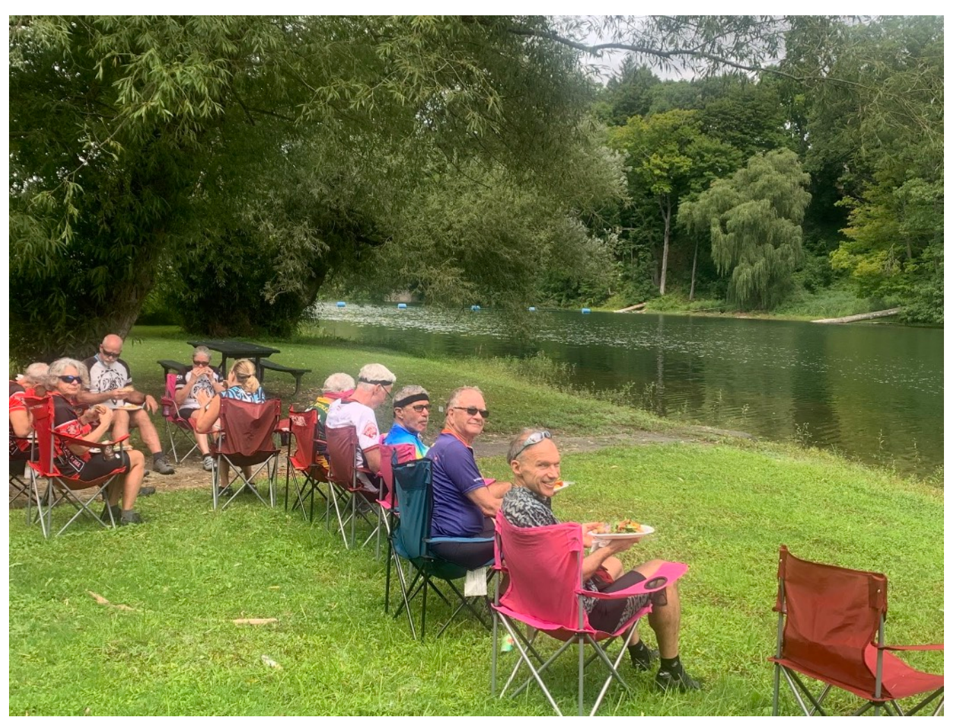
Lunch by the River