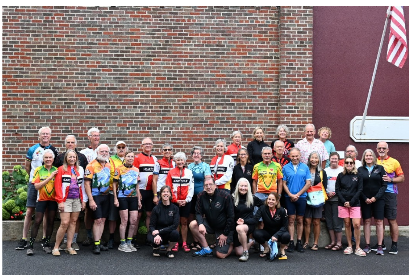
The ride was full of camaraderie, everyone was so happy to be out riding on excellent routes, with great SAG support, a beautiful hotel, and exceptional planning beforehand.