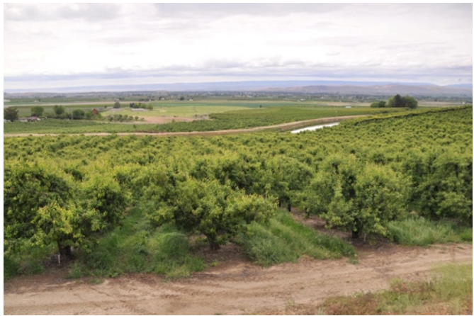
Vineyards and Orchards

On Sunday, May 18 th , we rode up Chinook Pass. Riders could ride either 94.6 miles, up to the gate that had just been opened the day before, or they could add another 9 miles by riding 4.5 miles up to the summit and then back down to the lunch stop. This ride began in Naches and from the start, we immediately faced brutal headwinds, which didn't let up until after the first SAG stop. We faced moderate headwinds from this point on. As we rode higher in elevation the temperature dropped into the 40s. Riders layered up at the lunch stop and didn't hang around long before heading down the mountain. The 40 or so miles back to Naches was a smokin' descent with a roaring tailwind and a beautiful ride along the Tieton River. This was a challenging and rewarding ride through very scenic terrain with an elevation gain of 5500 feet.