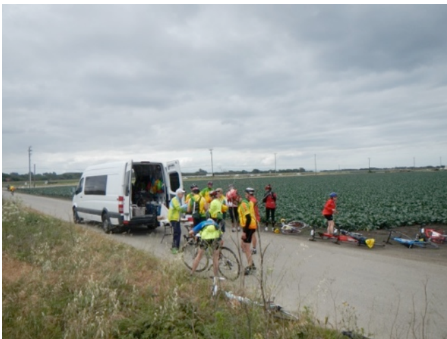
Sag stop among the vegetable fields

Highlights of the trip included miles and miles of white sandy beaches, seals basking on rocks and on beaches, endless vegetable fields, many spectacular sunsets, flowering plants lining the road (the ice plants in full bloom were especially beautiful and special), and an optional tour of the Hearst Castle at San Simeon.