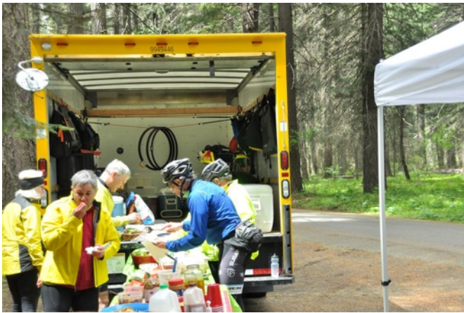
Lunch off the Truck