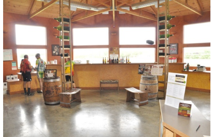
One of Many Wineries