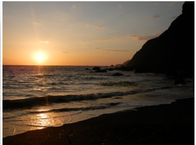
Sunset at Ragged Point, one of many

We spent the last two nights of the trip at a beachfront hotel at Pacific Beach. On the last day we rode from the hotel to the docks in downtown San Diego where we took a ferry to Coronado Island, then rode on a bike path down to Imperial Beach, on the Mexico border. Most of us stopped within a couple of miles of the border, but Stu and Henry rode down a dirt trail to get closer and attracted the attention of the border patrol. John suggested they shoot first and ask questions later.