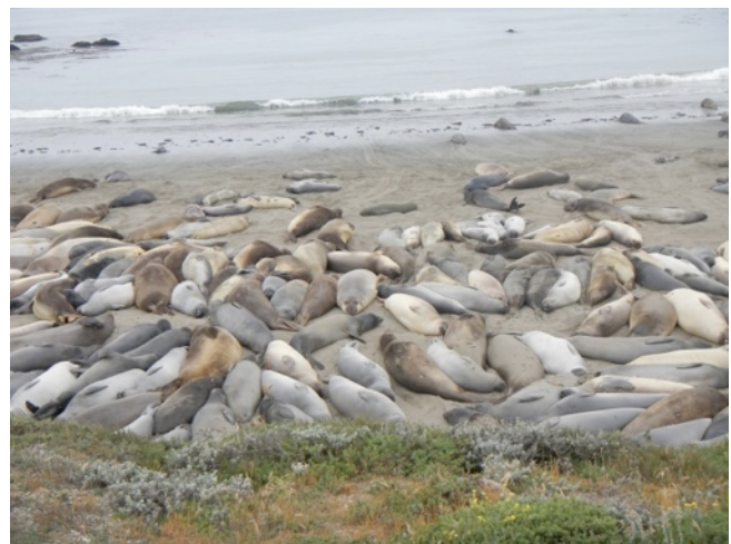
Elephant Seals at Pt. Piedras Blancas near San Simeon. This is “birthing” season and the population is about 15,000.