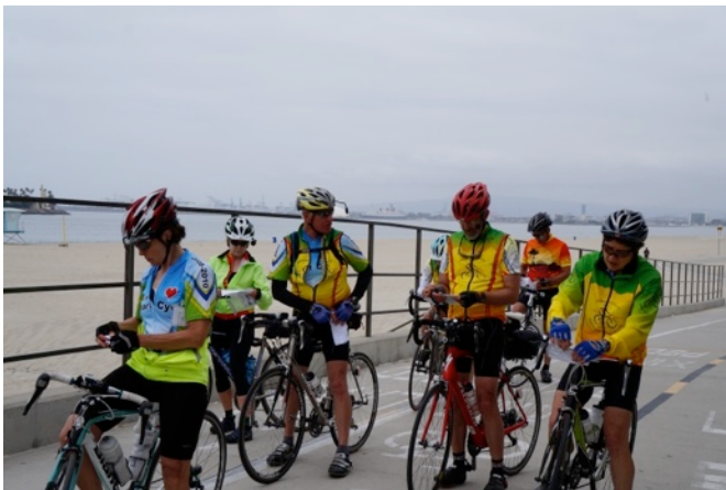
Are we on the right bike path?

Following the cue sheets when there were dozens of turns, especially on the bike paths, was sometimes a challenge. In one instance, correctly following the cue sheet led to a dirt road!