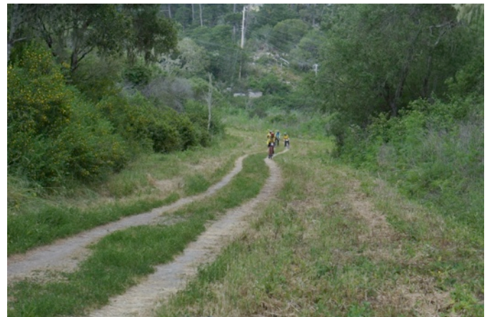
The route to Carmel included a dirt road