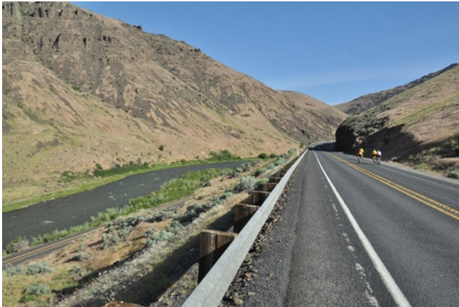
The Beautiful Yakima Canyon

and downs all along the canyon, past the sag stop and on to lunch at the other end of the canyon. It was a great ride without the wind that had plagued us the last few days. Everyone managed to arrive at lunch at the same time. So we could pose for a group picture. We returned exactly the same way we biked out, our speed varied depending on how quickly we felt we needed to get back home.