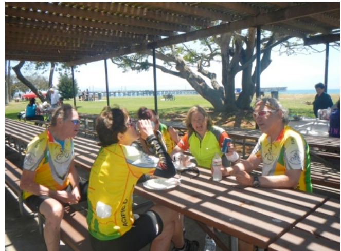
Lunch at a beach pavilion in Santa Barbara

A characteristic of the trip was the numerous bike paths that we followed, many directly along the beach. This was especially helpful in the Los Angeles area where we cycled along all the famous L.A. beaches, including Santa Monica Pier, Muscle Beach, Venus Beach, and ultimately Manhattan Beach where we spent the night. Of course, this was balanced by doing some miles on busy highways including U.S. 101 and CA1, but this was minimal, especially considering the populated areas that we were traversing. Overall the route was excellent and very beautiful.