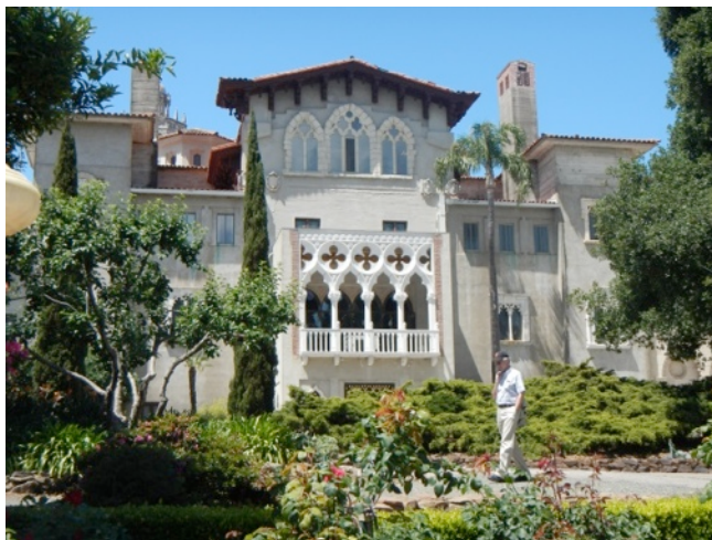
Hearst Castle near San Simeon