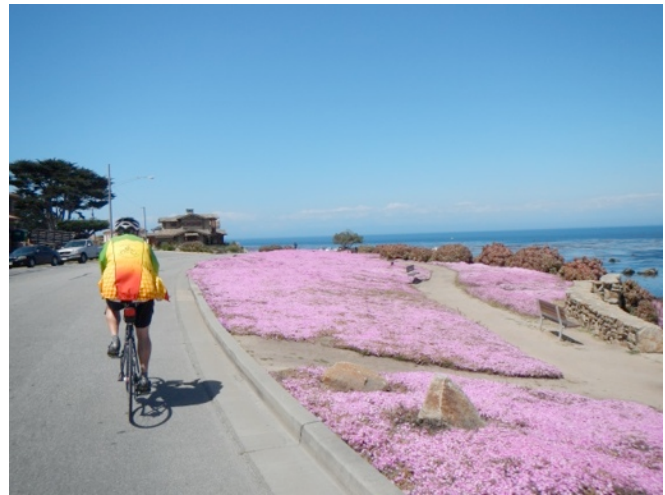
Beautiful flowers lining the road