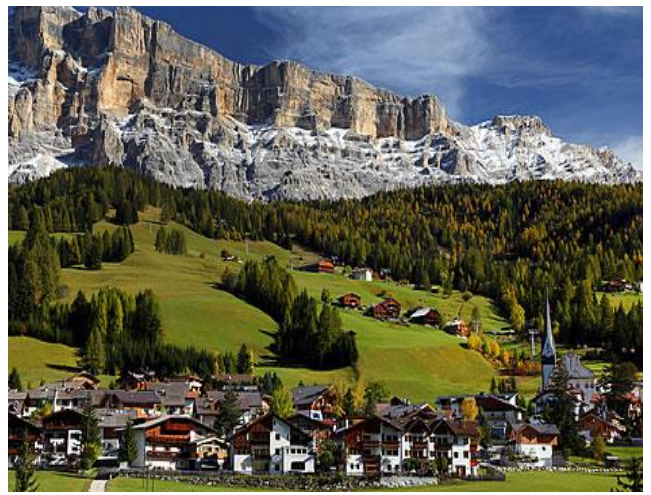
ALTA BADIA, ITALY

NOT INCLUDED IN TOUR PRICE Beverages with dinner Lunch Bike rental Massage or Facial Treatments, etc. SAG SUPPORT (will not be provided)